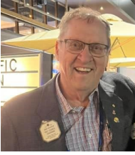
Welcome - ANZI Pacific Forum 2025 Chair